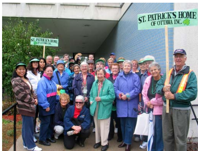
Some of the 2008 Walkers