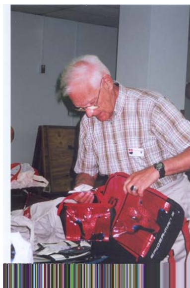
Volunteer filling backpack

Last year, the nation-wide program received 7000 backpacks, a 900 percent increase over the previous year. Although the results of this year are not yet in, the goal was 10,000 backpacks.